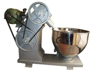
DOUGH ATTA KINDER