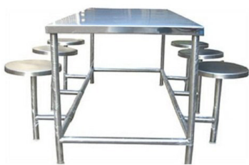
DINING TABLE - II