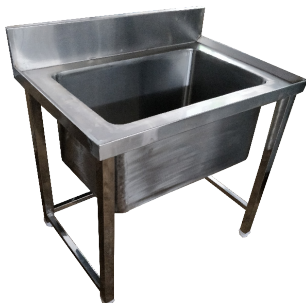
SINGLE SINK CUSTOMIZED