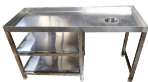
DISH LANDING TABLE