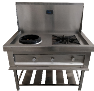
TWO BURNER CHINESE RANGE