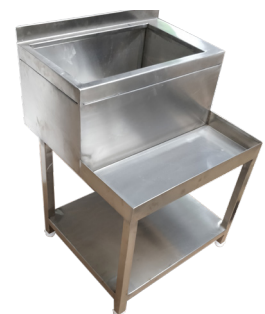
BAR EQUIPMENT - IV