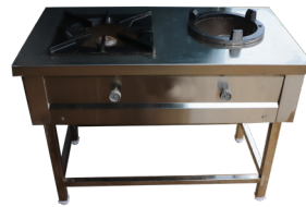
TWO BURNER INDIAN RANGE