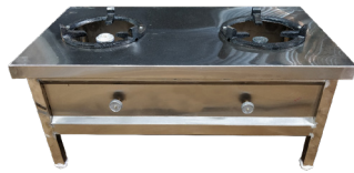
TWO BURNER BULK COOKING RANGE