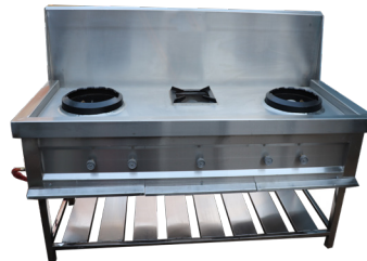
THREE BURNER CHINESE RANGE