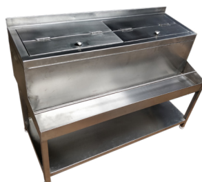
BAR EQUIPMENT - II