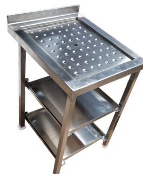
BAR EQUIPMENT - III