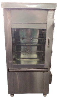
GRILL CHICKEN MACHINE