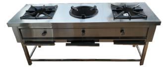
THREE BURNER INDIAN RANGE