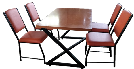
DINING WITH CHAIRS