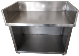
TEA COUNTER - I