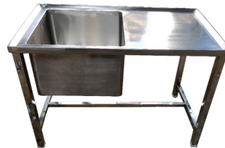
WORK TABLE WITH SINK