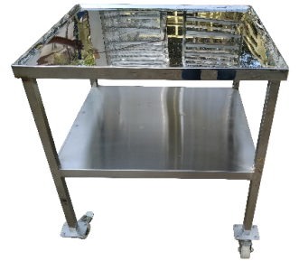
WORK TABLE MOVEABLE