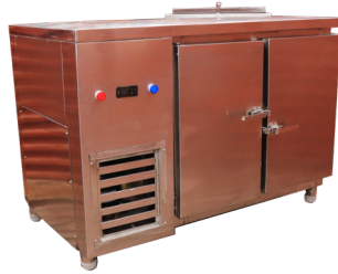
WORK TABLE CUM FREEZER