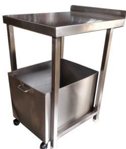
BAR EQUIPMENT - I