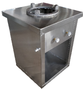
SINGLE BURNER CHINESE RANGE