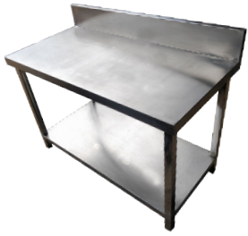
WORK TABLE WITH FLASH