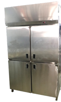
FOUR DOOR REFRIGERATOR