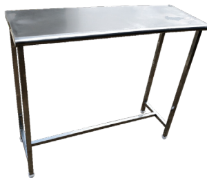
STANDING TEA TABLE