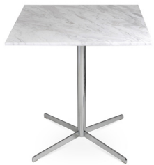
DINING TABLE - I