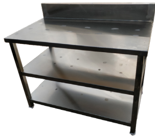
TWO TABLE WITH UNDER SHELF