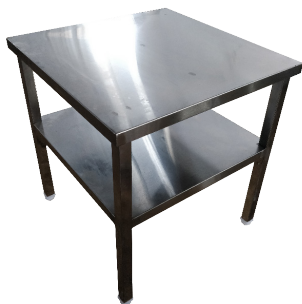
TANDOORI CUTTING TABLE