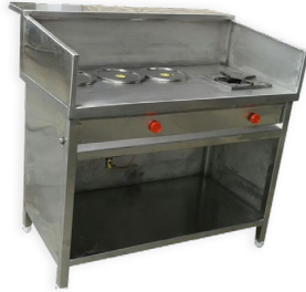
TEA COUNTER - II