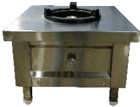
SINGLE BURNER BULK COOKING RANGE